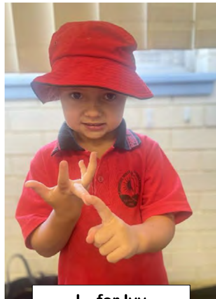
I – for Ivy